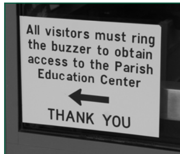
Security procedures ensure safe entrance and exit to the Parish Education Center.