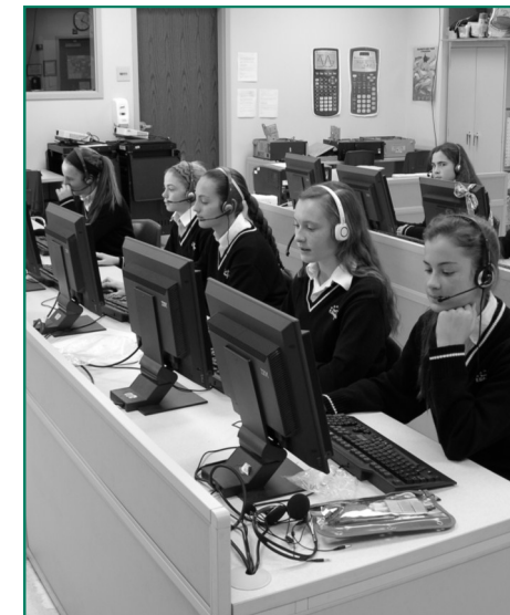
Seventh graders at Saint Elizabeth Parish School are learning a new language through the Rosetta Stone-based curriculum.

The goal of implementing a language learning program is to build a solid foundation, so that Saint Elizabeth students are well-