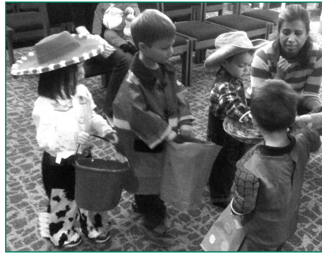
The Elizabeth Ministry held its annual Trick or Treating with the Saints play date on October 29. Parish children dressed in their costumes went to different stations in the church, learning about important Catholics. After each station, they got to pick out a treat. The children also made fun arts and crafts while their moms socialized.