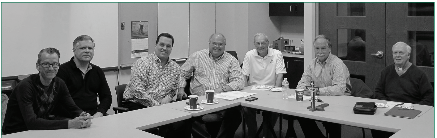
Saint Elizabeth's newest ministry is Chosen Fathers, which supports fathers with children who have physical, mental, sensory or emotional challenges. The program has quickly become a model for other parishes.