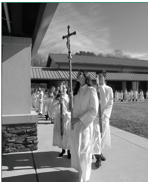
Confirmation candidates process into the church for the Sacramental Mass. In all, 195 parish girls and boys received the gifts of the Holy Spirit on Saturday, March 12, 2016.

Sealed with the gift of the Holy Spirit, and fully initiated into the Catholic Church, some of our young parishioners reflected upon how they found Jesus through this sacrament, and how they will live as disciples this summer: