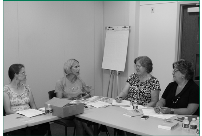
The Family Life Ministry Team is developing programs for divorced and separated Catholics, Pre-Cana, and family enrichment.

Another committee of the Family Life Ministry Team is researching various models of Pre-Cana programs as they work to design a program for presentation to engaged couples at Saint Elizabeth. Each year an average of 25 weddings are celebrated at our parish. For now, engaged parishioners complete their Pre-Cana marriage preparations either at another local parish (such as St. Joseph in Downingtown or SS. Philip & James in Exton) or through the Archdiocesan Pre-Cana program. The team anticipates offering a Pre-Cana Program at the parish two or three times a year and aims to conduct the inaugural program in the