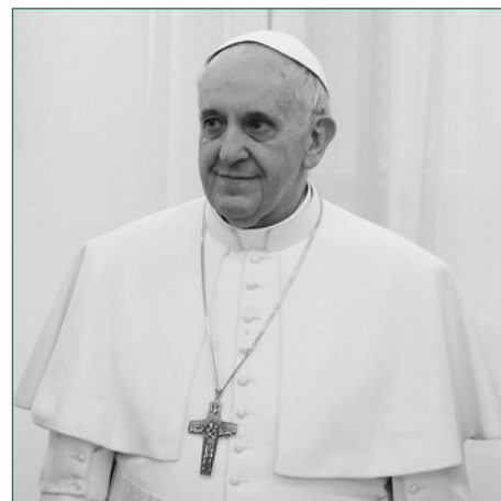
Cardinal Jorge Bergoglio of Argentina became the Holy Father, Pope Francis, after his election in March.